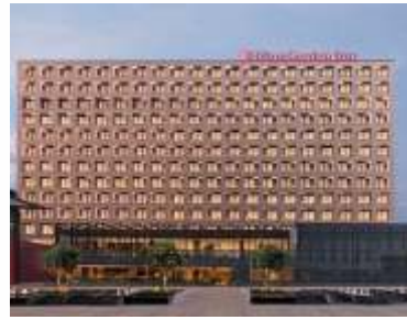
Hilton Garden Inn Bengaluru