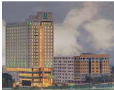
Holiday Inn Racecourse