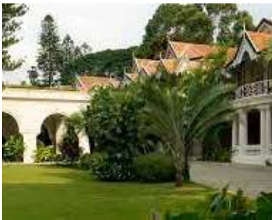
West End Taj